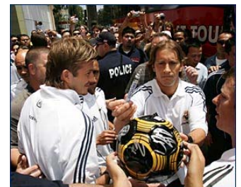
Madrid players sign autographs

Real Madrid were in town for the American tour, and in a wonderful opportunity for Magic Players, they were invited to a Chicago Magic only signing party with the Spanish soccer giants. Real Madrid, often referred to as the 'Galacticos' due to the notion that they are the best team in the Galaxy, took time from their busy schedule to meet with Chicago Magic players. Many of the Chicago Magic players' heroes were there in the flesh: David Beckham, Ronaldo, Roberto Carlos, Michael Owen...you name him, he was there; all 24 players from Real Madrid were signing autographs for Magic players!